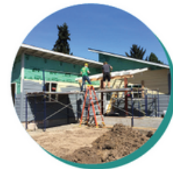
3. Advanced Project