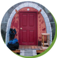
1. Introductory Project

Starting with an introductory project before moving onto more advanced construction projects can help you develop a solid foundation of knowledge, skills, and relationships that will help you succeed in more complex projects in the future. In CBF, an introductory project of building 54 sheds was implemented in a response to the Holiday Farm Wildfire in 2020. With the experience gained from the introductory project, our team of stakeholders were able to progress into an intermediate project through building transitional shelters. Eventually, our goal to leverage our stakeholders into leading advanced projects such as a residential build led by industry partners.