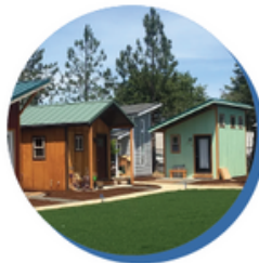
2. Intermediate Project